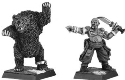
Pack contains one bear and bear tamer